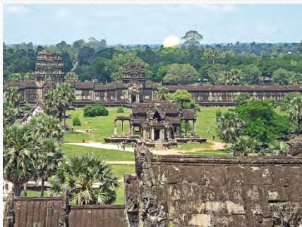
Images of private guided tour Angkor Wat, Cambodia