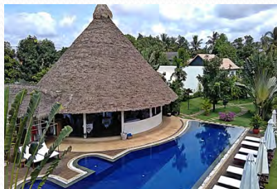
Pool and restaurant