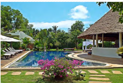
Pool and restaurant