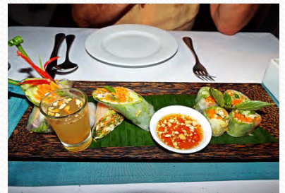
fresh organic spring rolls