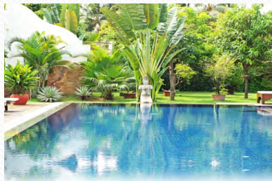
fresh water pool