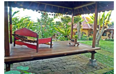
Bale used for workshops